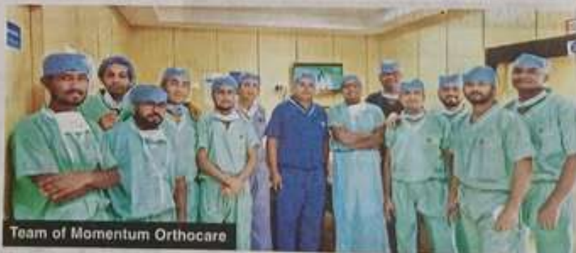
Team of Momentum Orthocare