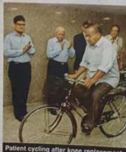
Patient cycling after knee replacement